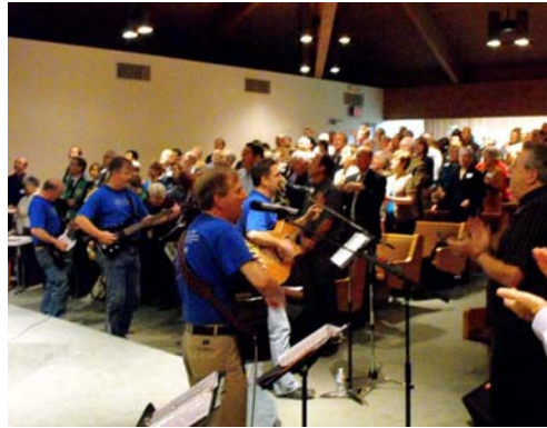
Members of St. Paul Praise Band