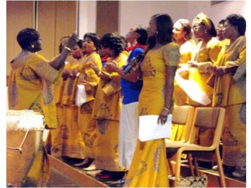
St. Paul Calabash Choir