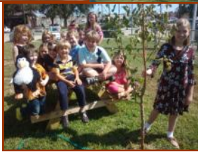
We love our new spruced up playground