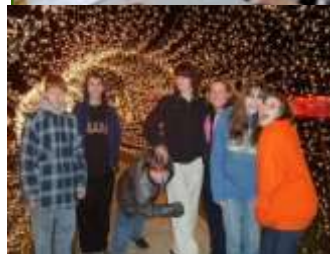
...and had some fun at the Dickinson Festival of Lights