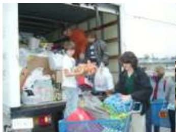
JR High's helped at ICM over the Holidays...

The Youth of WPC want to express their sincere gratitude to the congregation for your support of this year's holiday fundraiser, which raised $994.72 toward the youth's summer trips, conferences, and camps that can make a life-changing difference. Along with your donations for using the Youth Postal Express to deliver your Christmas greetings, there was tremendous interest in the additions this year of WPC Christmas ornaments, greeting cards, and the Youth-made coasters. As we celebrated the wonderful gift of Christ, our Youth wanted to acknowledge the blessings of their WPC family and extend a heartfelt "Thank You" for the gift that is you.