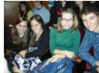
Some of the Sr. High's who attended a production of the AD Players